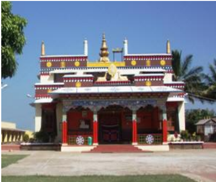
Exterior of the Tashi Lhunpo Monastery Temple

Tashi Lhunpo Monastery is one of the four great monasteries of Central Tibet. It is the traditional seat of the Panchen Lama, and through the last four hundred years was supervised and looked after by the Dalai Lamas and the Panchen Lamas.